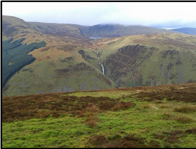
The Grey mare's Tail with loch Skeen beyond. Clouds just resting on Lochcraig Head. White Coomb is to the left.

be seen. At this point we were looking down on the top of the Grey mare's Tail and it was a spectacular sight.